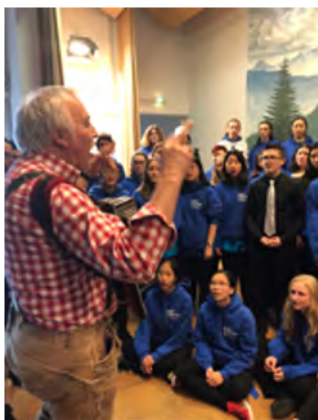
10 Day European Tour At YVR March 2018