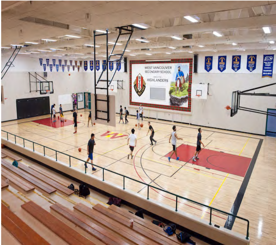
West Vancouver Secondary School Main Gym