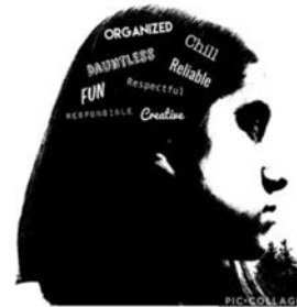
Who I Am