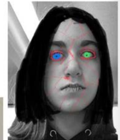
My Dark Side