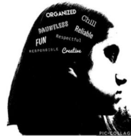
Who I Am