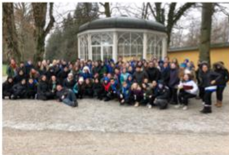
"Sound of Music" Tour Salzburg, Austria March 2018