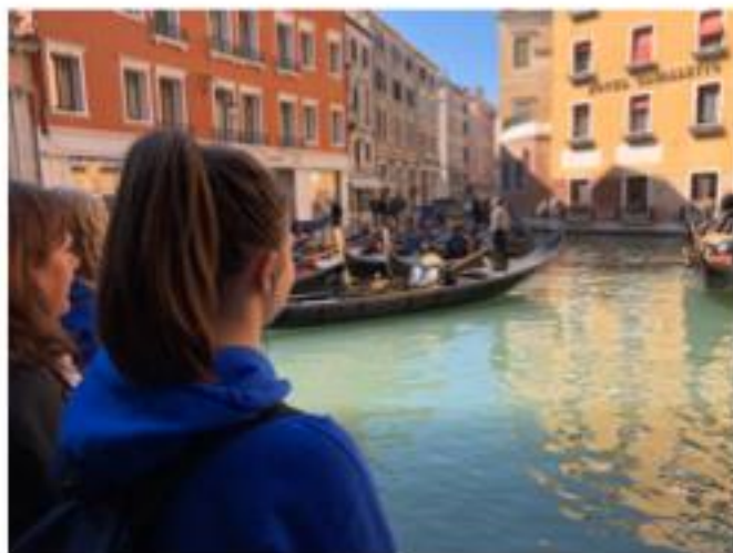
Checking out the gondolas in Venice March 2018