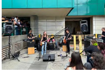
Rock band playing