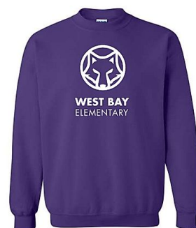
ADULT SWEATSHIRT $28.95