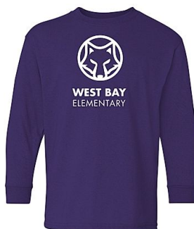
YOUTH T SHIRT $23.25

Will go live first thing on 6 January and will remain open for ordering until 11:59 PM on 20th January