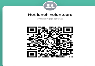
Scan or upload this QR code using the WhatsApp camera to join this group