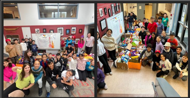
GRADE 6 STUDENTS MAKING CONNECTIONS “How We Express Ourselves and Social Justice”

To everyone who generously donated and has made a difference to the many families using the North Shore Food Banks. Grade 6s have worked tirelessly. Well done them!