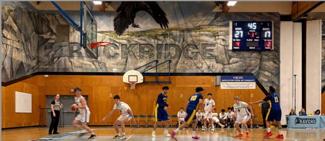
Basketball action is back at The Rock. Above, Raven Senior boys in action with Howe Sound on their way to an 86 - 60 victory on Tuesday night at home.