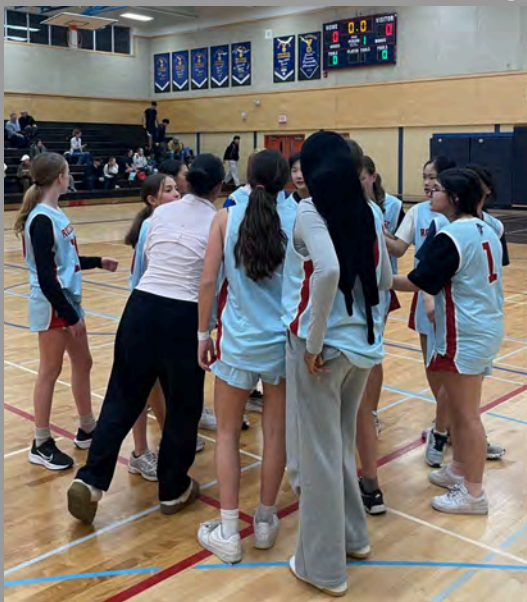
Below: Rockridge Bantam Teams in Action