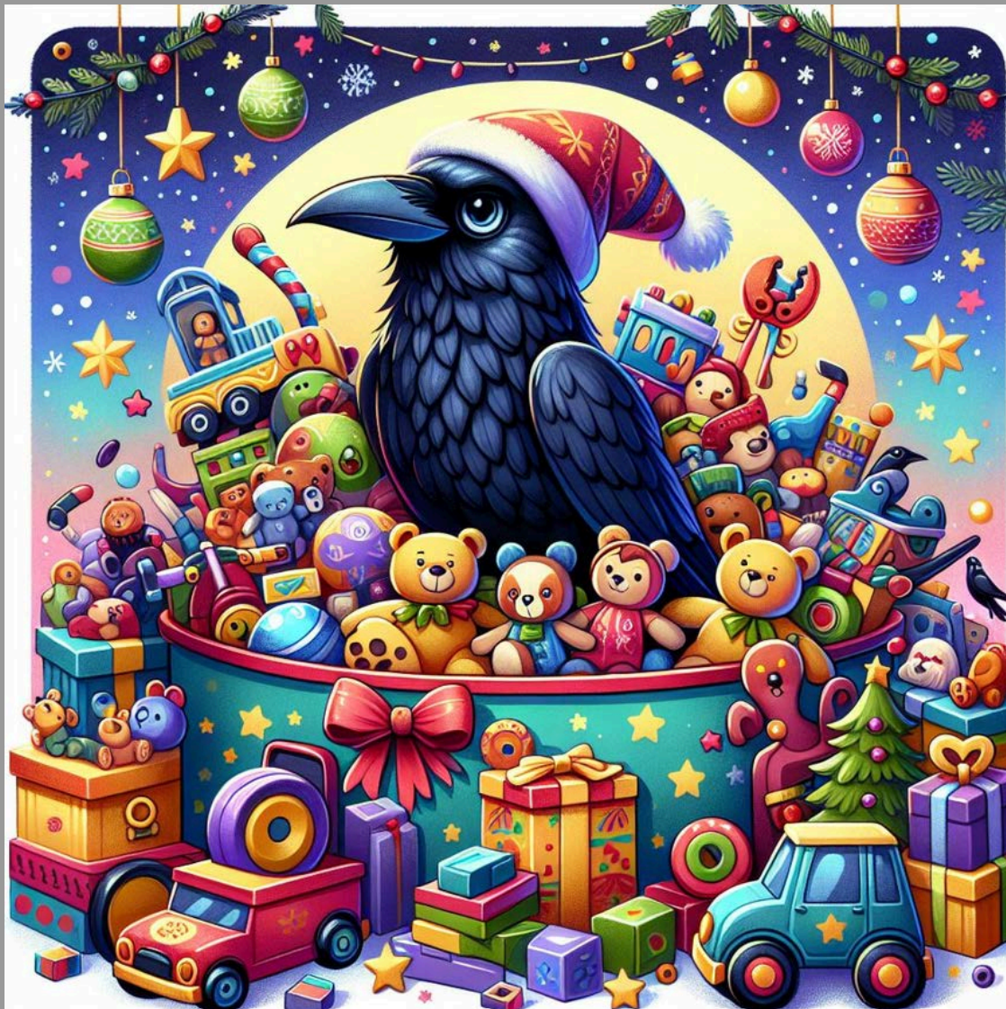
ROCKRIDGE Toy Drive 2025