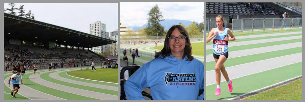
NSSSAA Track & Field - Day 1 of 2, 2025. After the first day of competition, 10 Rockridge athletes have qualified for the Vancouver Sea to Sky Zones Championships that will take place next week.