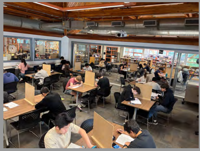
Saturday was rocking at Rockridge this past weekend with Rockridge hosting the BCSSRU Invitational Rugby 7s Tournament, Practice AP Exams and Drumline preparing for Provincials.