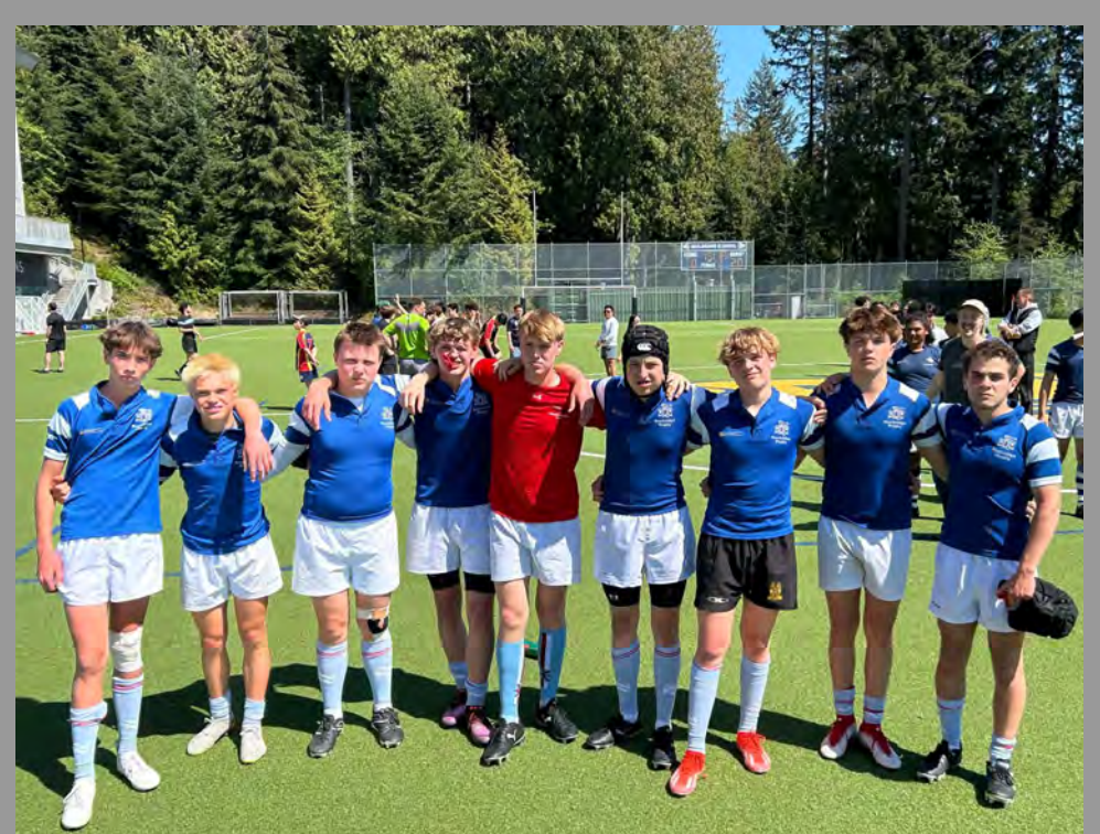
Grade 9 and 10 Rockridge Rugby enjoying a successful run today at the Rugby 7s Tournament at Mulgrave School.