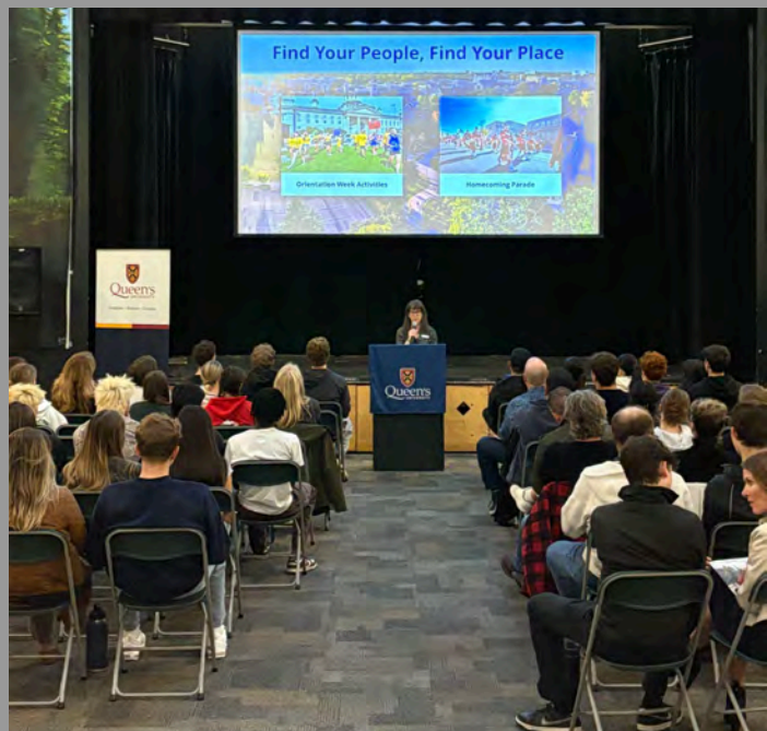
Rockridge hosted the Queen's University Admitted Student Event for the Northshore last Thursday night with students from as far away as Whistler attending. It was a wonderful opportunity for interested students to meet Queen's faculty members and ask pertinent questions.