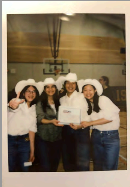
Our Rockridge Drumline placed first at their Regional Competition on Friday! They put on an entertaining performance and wowed the audience at Burnaby North Secondary School.