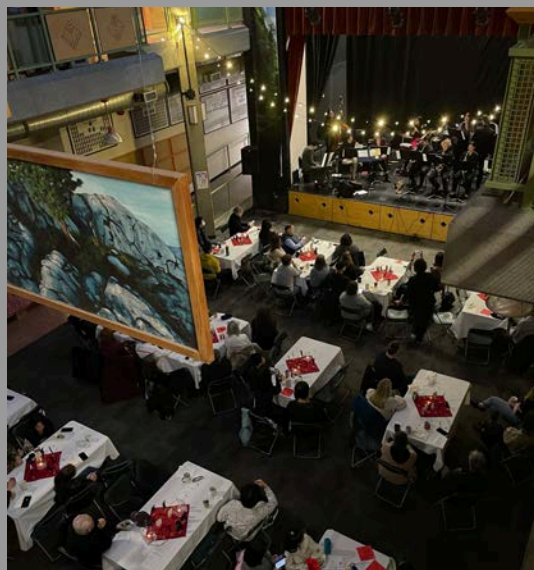
A photo from the Jazz Cafe in 2024

We hope to see you at our Rockridge Jazz Cafe! First-come, first-serve tickets are now available on School Cash Online, and will sell quickly. Get yours now for $15, or $20 at the door. See details in Ebulletin Thanks to Jazz student Olive K. for the pencil sketch featured on our Jazz poster.