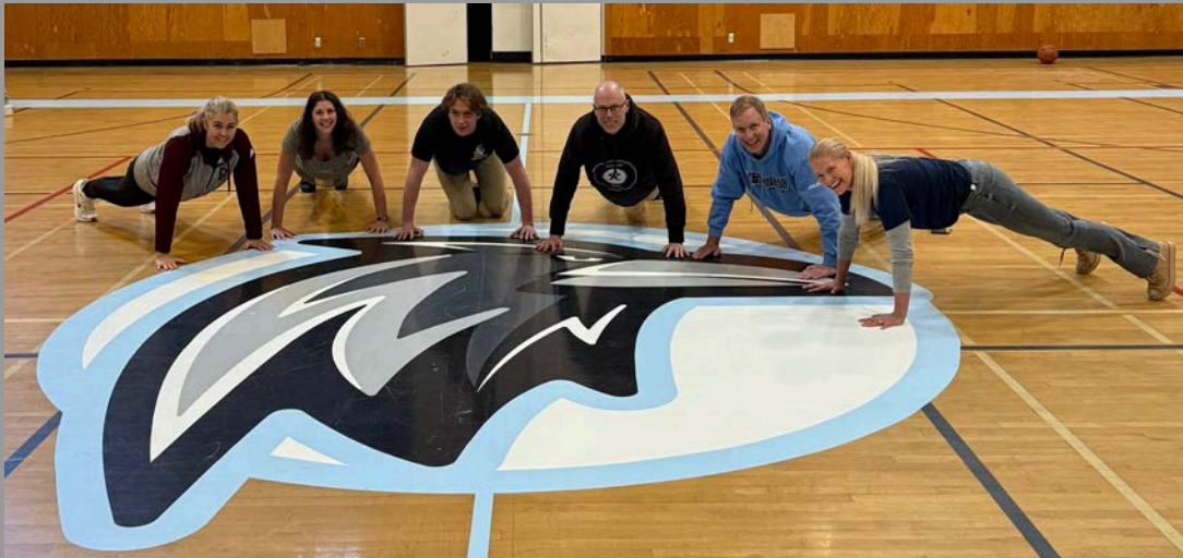
Some of our team members who participated and helped make a difference for the Canadian Mental Health Association