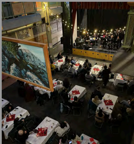
A photo from the Jazz Cafe in 2024

We hope to see you at our Rockridge Jazz Cafe! First-come, first-serve tickets are now available on School Cash Online, and will sell quickly. Get yours now for $15, or $20 at the door. See details in Ebulletin Thanks to Jazz student Olive K. for the pencil sketch featured on our Jazz poster.