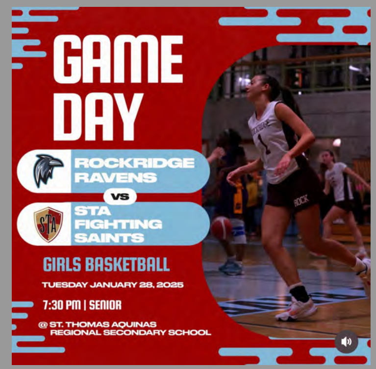
Senior girls headline a lot of basketball action in the coming weeks including the John Knox tournament this weekend. Follow our rockridge.athletics Instagram page for posts on upcoming games and results for all our winter teams.