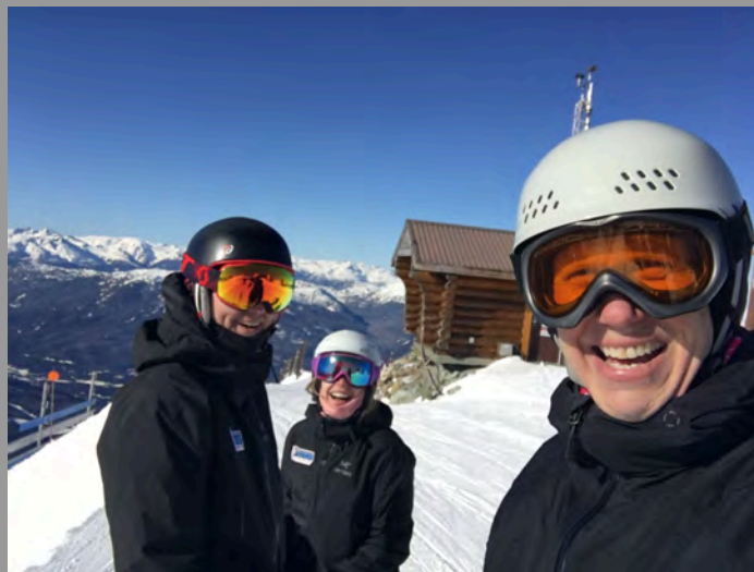
Grade 8-10 Ski day last Wednesday had some great conditions and so many happy moments.