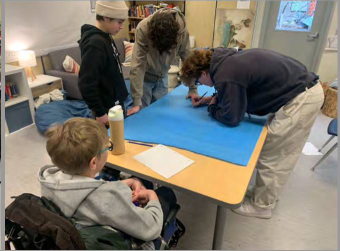
Rockridge Athletics Leadership students are visiting our feeder schools ahead of the Flock to The Rock event to help students prepare . . . . .