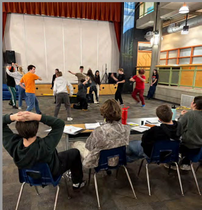
Rockridge Theatre Company is preparing for their March performances that will be held right here in Players Hall at Rockridge. See future E-Bulletins for more show information, trailers and more.