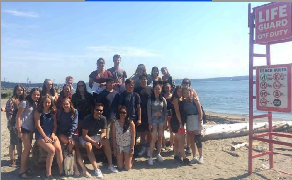
FAST Students finishing a training exercise on the beach in Ambleside

The First Aid Swim Training Program is a unique opportunity for students to develop the essential skills and confidence to become successful lifeguards while also building leadership and resilience.