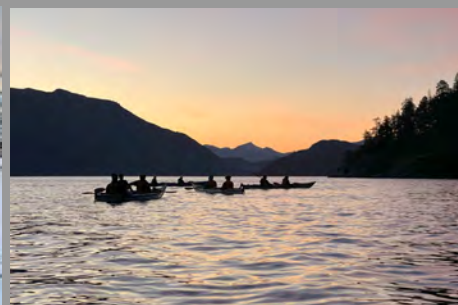
PHE Outdoor Recreation program for grades 10-12 - see details in Ebulletin