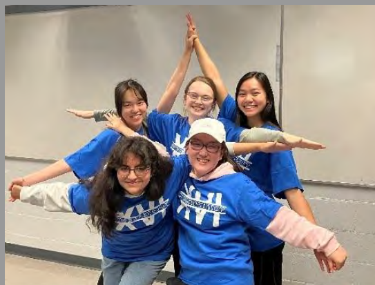
Computer Information Systems 12 – Cybersecurity & Artificial Intelligence See details in Ebulletin