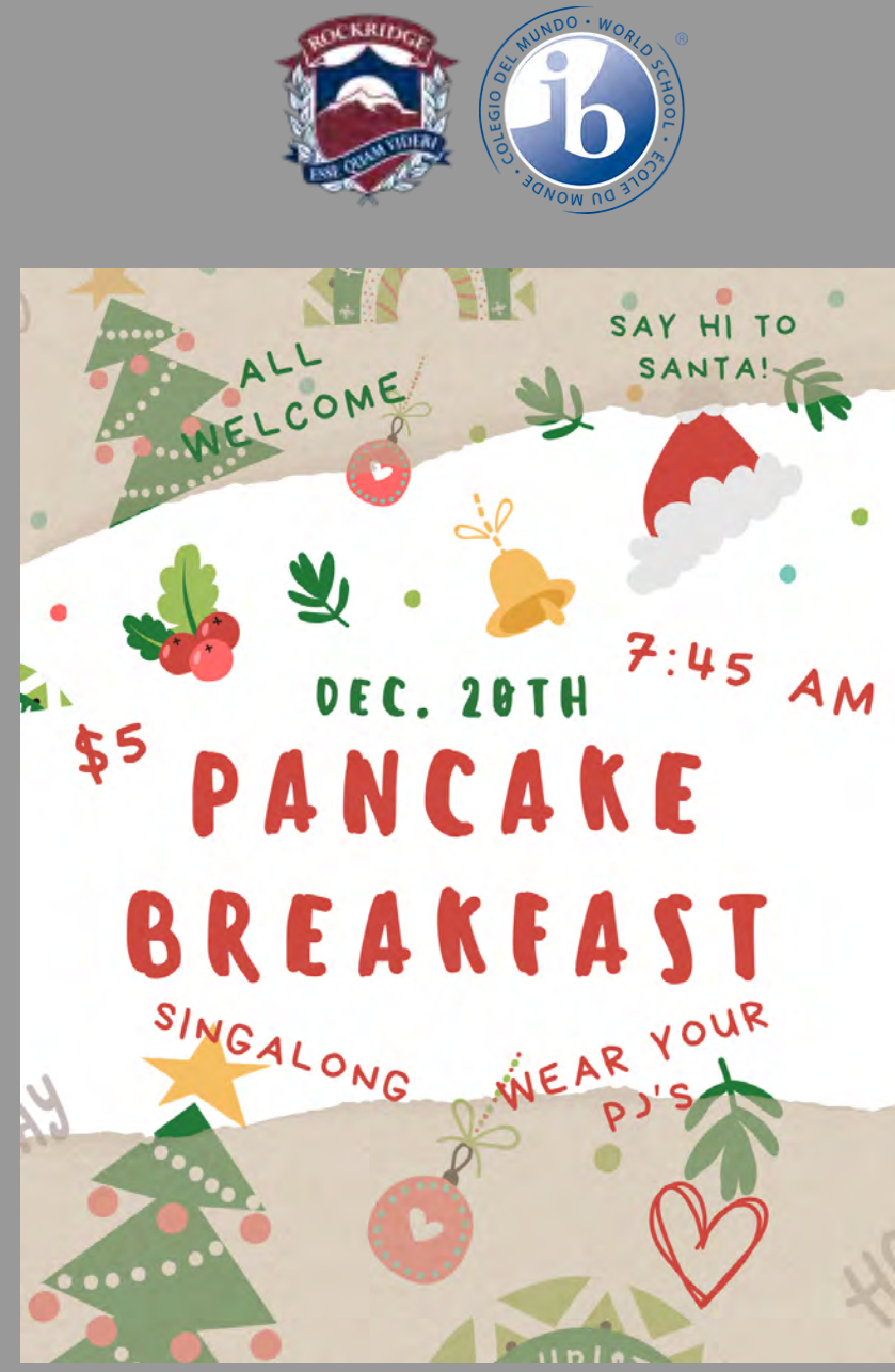
All students and staff are invited to join us for breakfast on Friday morning before our last day's special schedule and early dismissal at 12:00PM.