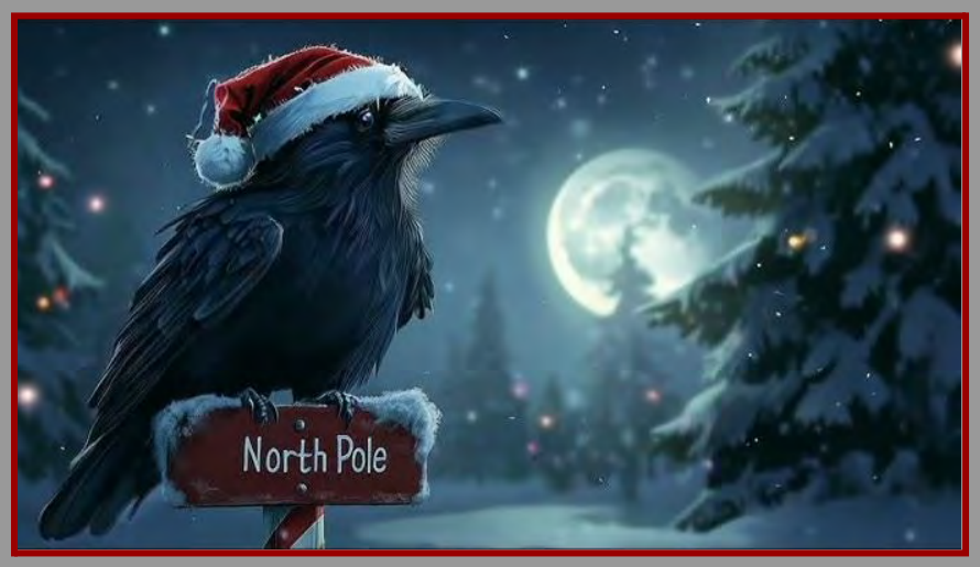
Celebrating the holiday season at The Rock.