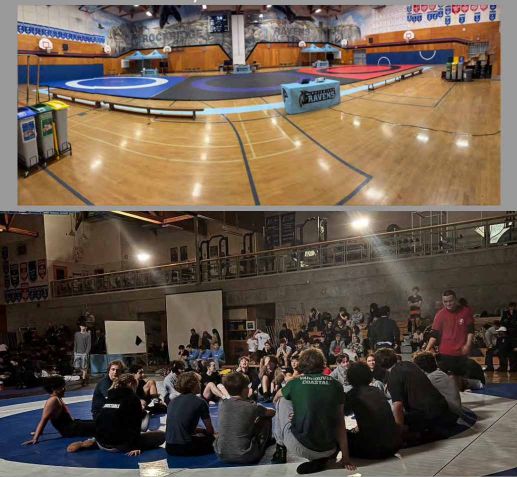
"The inaugural Raven Ruckus at The Rock was set and ready to roll Friday night, however mother nature had different plans knocking out power on the Saturday. The tournament was eventually cancelled but the morning warmup under spotlights won't soon be forgotten by these kids!