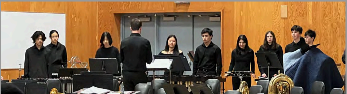
Sounds of the Season Musical Performances