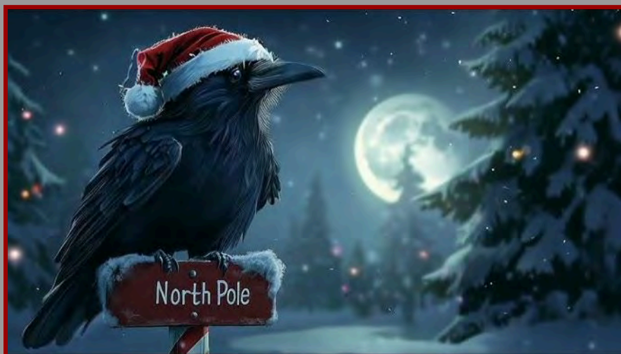
Celebrating the holiday season at The Rock.