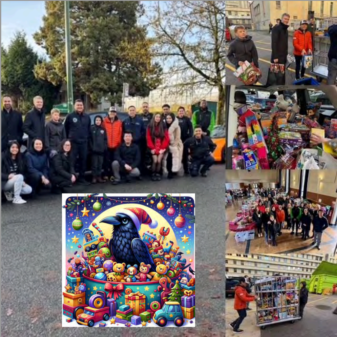
Rockridge Toy Drive 2024 Thank you to the Rockridge Community for your generous donations.