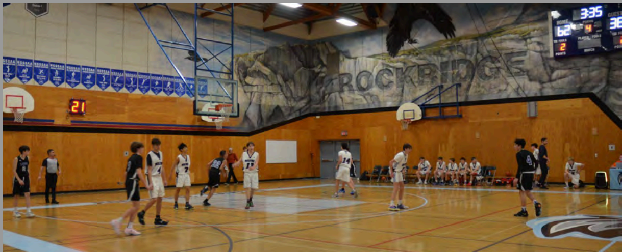
Junior Boys Basketball action vs LGCA