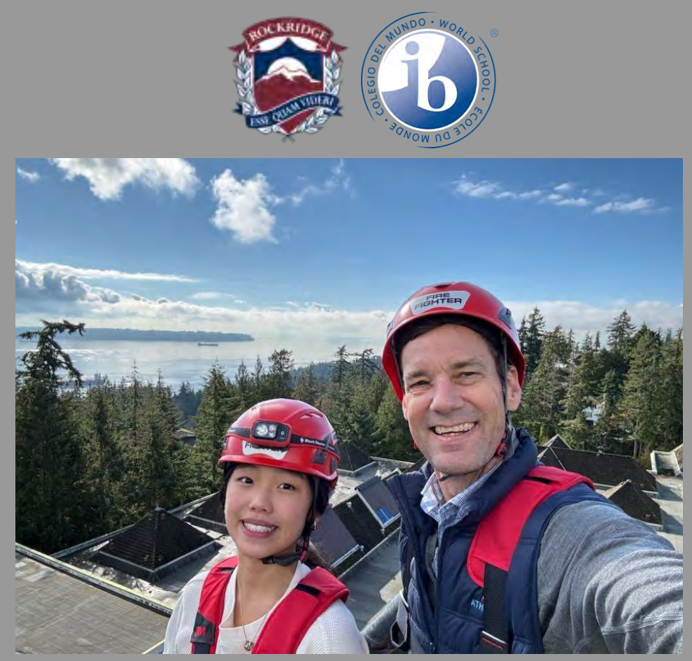
STEM Egg Drop with WVFD - a birds eye view!