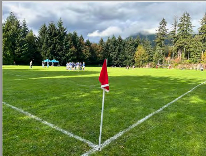
Game time for our grade 8 Ravens Rugby vs Argyle After a tough battle, the boys came away with a hard earned WIN 57-31