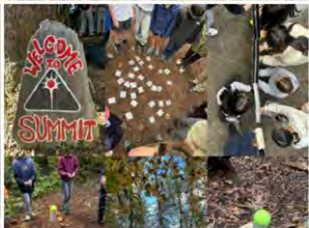
A few images from Grade 8 Students and Staff at Camp Summit yesterday and today.