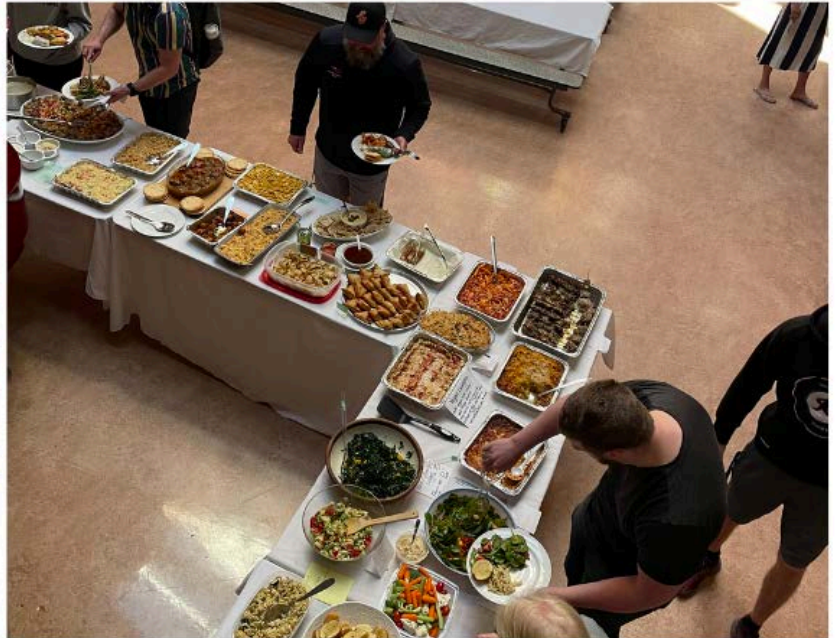
Staff Appreciation Lunch - Many thanks to all our Rockridge families for their donations to last week's amazing lunch that was served on the professional development day for our Rock star Staff.