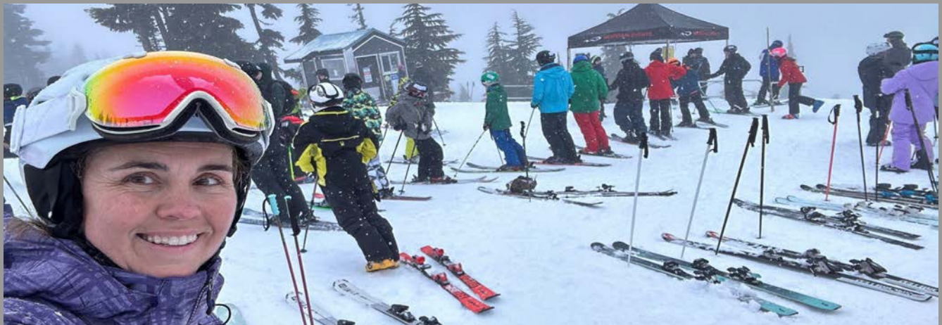
Rockridge Ski team at the start gate: North Shore Championships