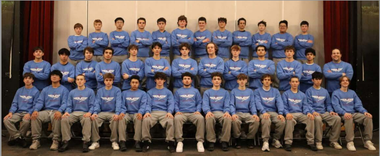
Rockridge Wrestling 4th place at NSSAA Championships.