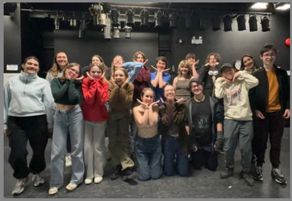
The Rockridge Theatre Lab is preparing for their production: BACKSTORY that will open on March 7th at the Kay Meek Arts Centre. See the BACKSTORY POSTER at bottom for more information.