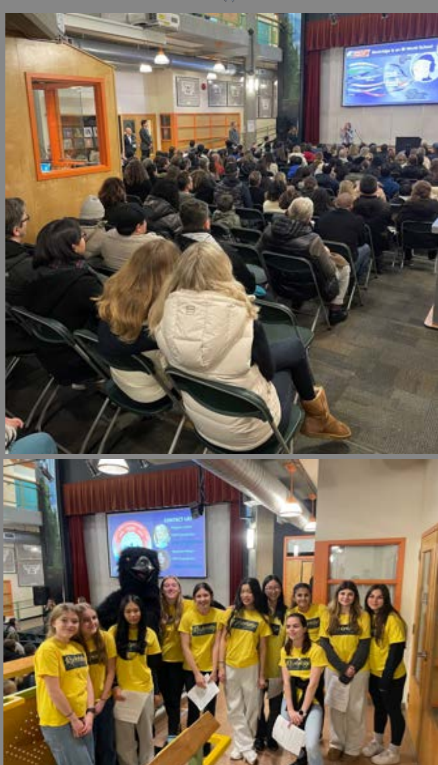
Last Thursday we hosted a very successful Grade 7 to 8 Information Evening that filled Players Hall with future Ravens and their families. From guided tours with our Gr. 10 Mentorship students, to Rockridge PAC members helping welcome new families, we showcased the great school that Rockridge is for all students on the road to graduation.