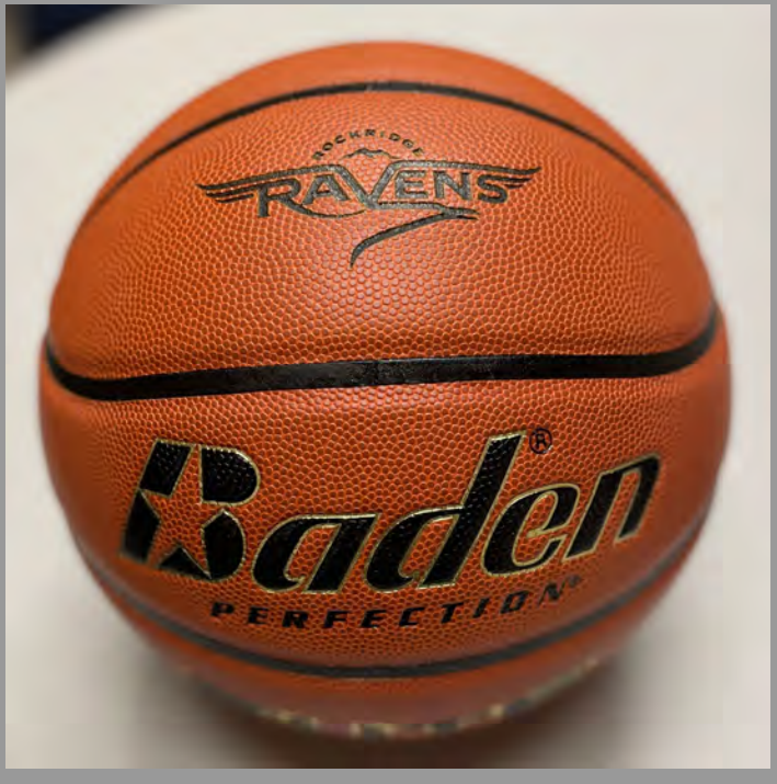
Cool new gear for the basketball season arrived this week!