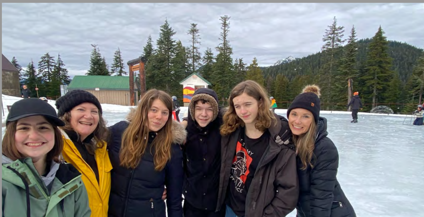
Feeling on top of the world last Friday while on top of Grouse Mountain. A fun day of skating and adventure for some Ravens last week.