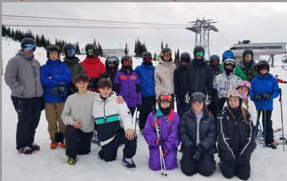
The Raven Ski Team hit the Whistler slopes yesterday for their first training day of the 2023-24 season.