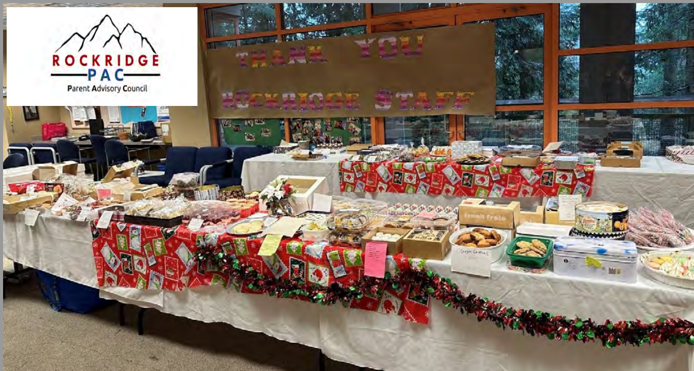
Thank you parents for making the Staff Appreciation Holiday Cookie Extravaganza truly special! Each staff member was able to fill a box of baked goodies to bring home for the holidays.