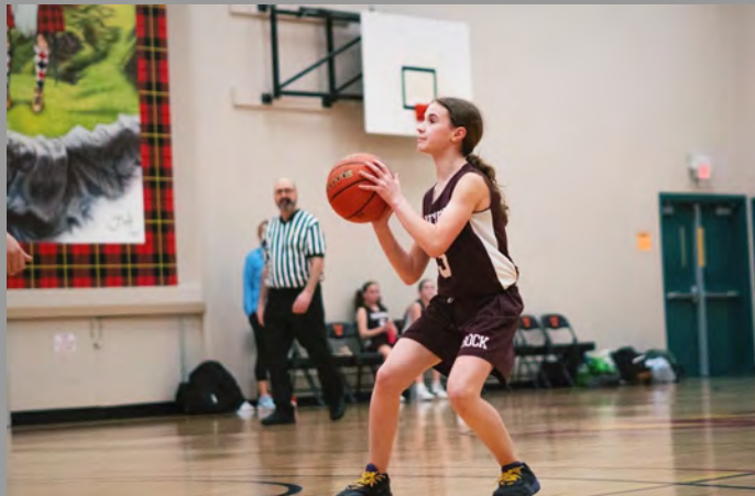
Above: Grade 8 girls basketball action against WVSS this week. Last week, the Grade 8 Ravens also participated in the CapU tourney held at Argyle.