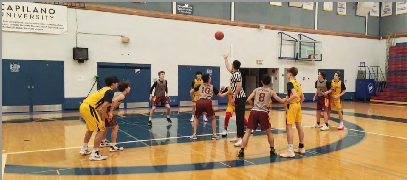
Rockridge Juvenile Boys in action at Capilano U. Tournament.