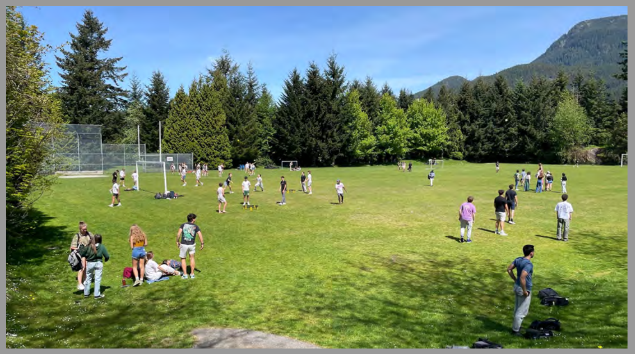
Using only an iPhone, it was hard to capture just how full the field, bleachers and benches were outside at lunch this week, but it was fantastic. Spikeball, football, soccer, picnics and volleyball were underway. So nice to see our Ravens enjoying our amazing outdoor space and this summer-like weather.