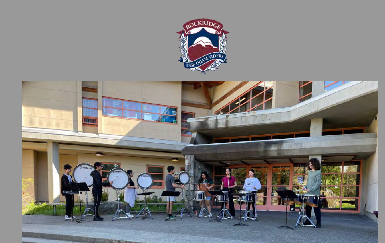
Last Friday the Rockridge Drumline took their practice session outside. They are preparing for their upcoming shows at the West Van Community Cultural Fest and the Rockridge Spring Concert on June 8th.