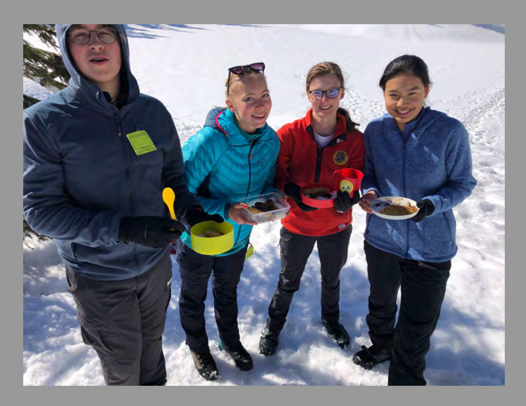
It was a fabulous day for West Vancouver Schools Outdoor Recreation to build snow kitchens and host the Iron Chef Competition.