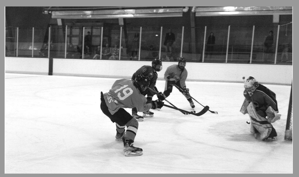
Rockridge dropped their opening game to WVSS on Tuesday, but the Ravens are already looking ahead to their game next Thursday vs Carson Graham. 2:30 PM puck drop.