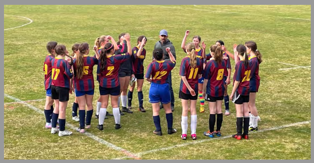
Our Raven Junior Girls are playing very well to start the season and have a 1 and 1 record.

Senior Girls Ravens defeated Carson Graham Secondary last week on penalty kicks. They lost on Tuesday to Sutherland 3-0.