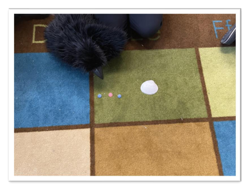
Integrating Mathematics and Social Studies