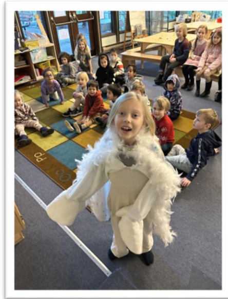
Elfis has entered the building

Please visit the West Vancouver Schools Admission Page to submit your application and for details regarding documentation