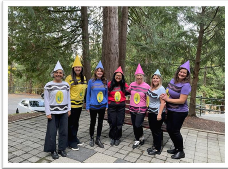
The Crayola Team for Halloween!