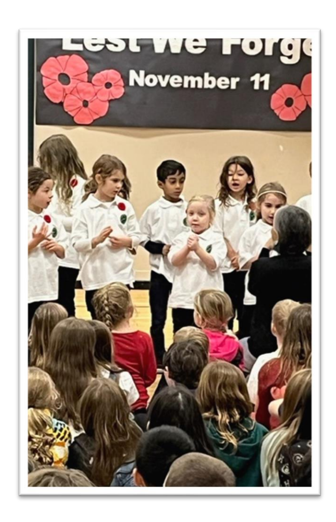
Lions Bay joined GEC for the Remembrance Day Assembly

Parents are also reminded that communicable diseases should be reported to your classroom teacher or to the school office. This would include lice, chicken pox, measles, impetigo, etc.