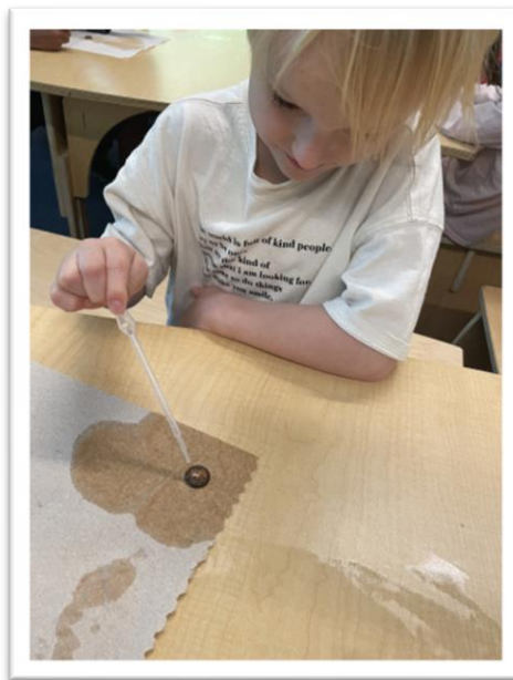
Experimenting with Cohesion