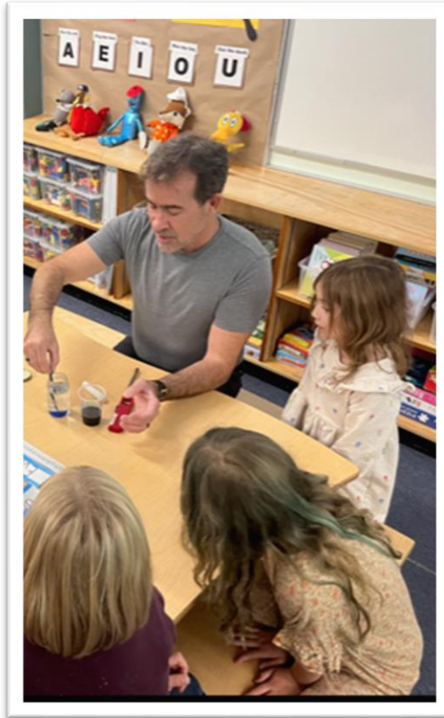
Science Made Fun Workshops