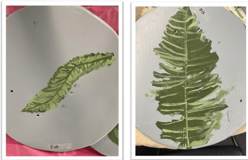
Fence mural in progress.