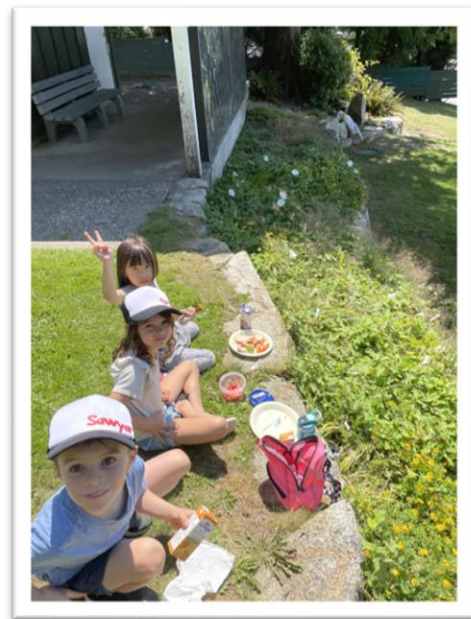
Beach Day lunch!