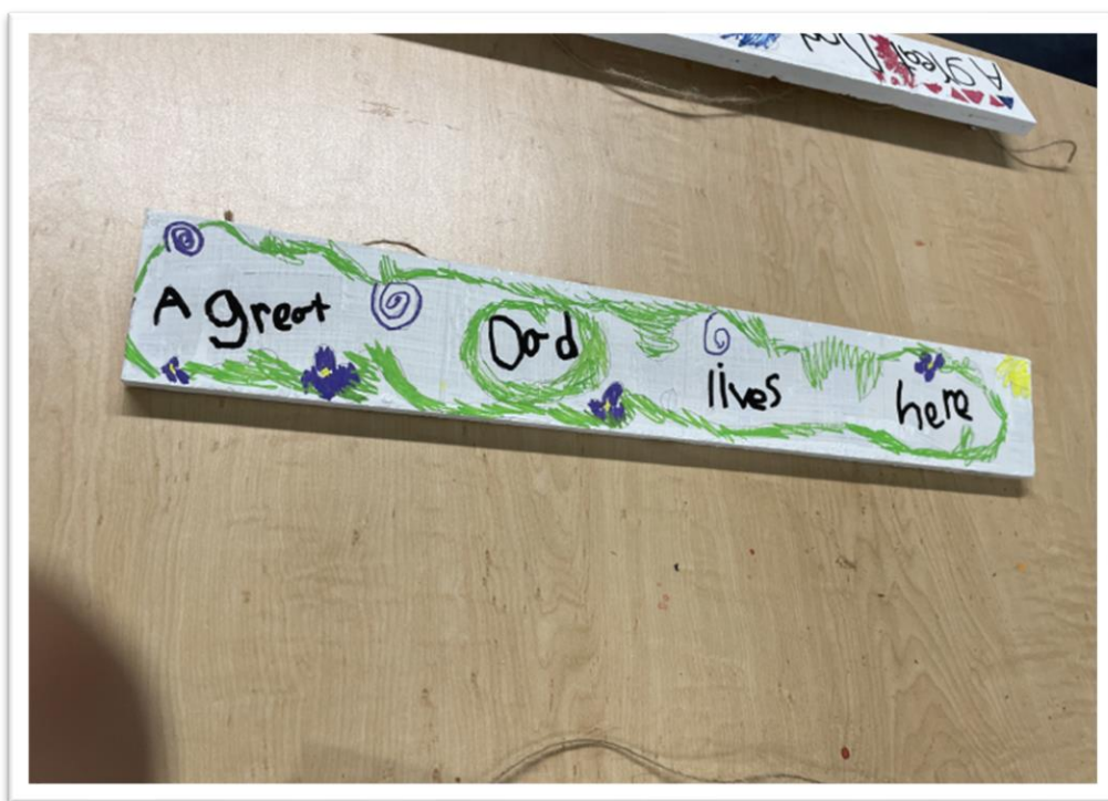
Using tools to make a special gift