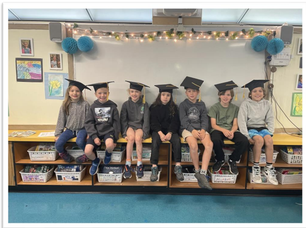
Well done Grade 3s! We will miss you!