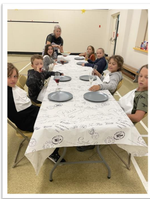
Grade 3 farewell luncheon