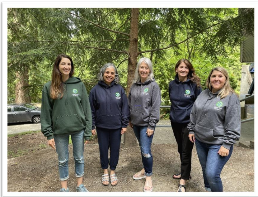
Thank you to the PAC for the Lions Bay spirit wear.