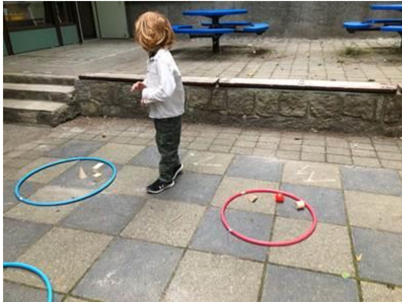
The K/1 Class sorted three dimensional solids.