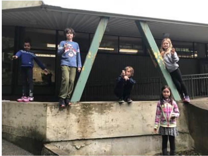
The Grade 2/3 class are studying rocks on site.