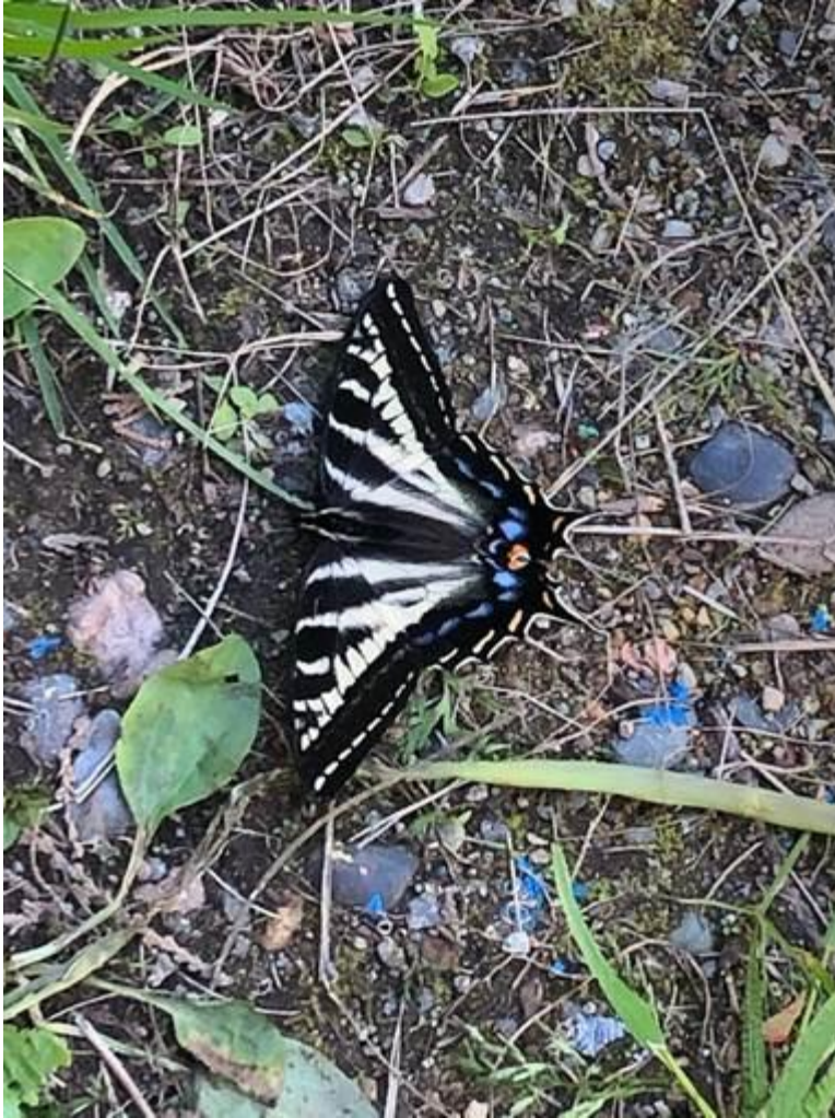
A beautiful butterfly found by Charlie in Kindergarten.