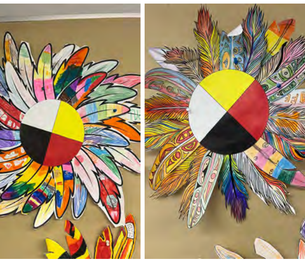
Individual Classes: Discussions at each age developmental level