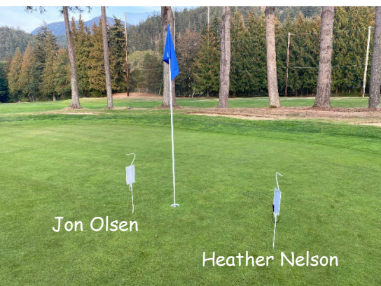
Pretty impressive! KP markers on hole #5.