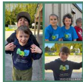
Photo Day Retakes will be on: October 23, 2025

Show your school spirit by ordering a hoodie, t-shirt or pair of sweatpants! On sale now through Munch-A-Lunch until October 12th.