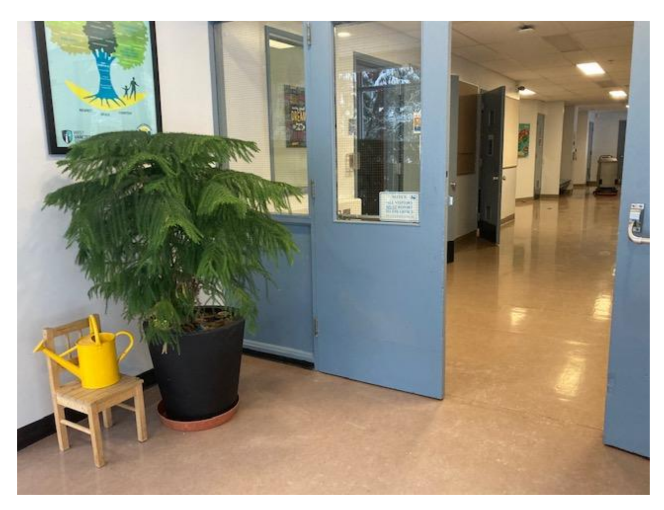
HAPPY 2022 and WELCOME BACK EVERYONE!

We are very excited to be welcoming our students back in person on Monday. During this first week staff have reviewed, revised and enhanced all provincial, district and school specific safety measures to ensure we are doing everything we can to keep the learning 'in person' here at Eagle Harbour.