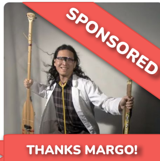
MUSICAL SCIENTIST CAD$100.00