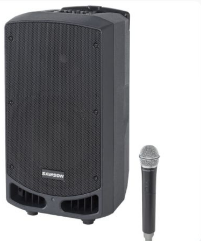
PORTABLE MICROPHONE & SPEAKER SYSTEM UPGRADE CAD$950.00

WE'D LOVE TO FIX THIS — And THANKS to the generous sponsorship from the GENS FAMILY now we can! A reliable portable sound system will make a huge difference — from keeping the energy high at outdoor events like Sports Day, the Terry Fox Run, and the Year-End BBQ, to ensuring every announcement and every student, teacher, and parent presentation at gym assemblies is heard loud and clear.