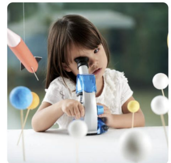
SCIENCE - HIGH TECH & HIGH TOUCH CAD$100.00