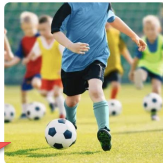
SOCCER WORKSHOP WITH WVFC COACHES CAD$100.00