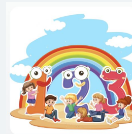
MATH RESOURCES CAD$750.00

— Funding Futures is our answer. With more than $30,000 in exciting initiatives to choose from, now's your chance to decide where our investment will make the greatest impact for your child. Cast your vote by sponsoring items on our list to help shape the future at Cypress Park.