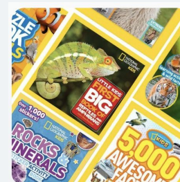
NATIONAL GEOGRAPHIC SERIES CAD$100.00