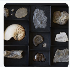
ANCIENT FOSSILS - UBC BEATY BOX