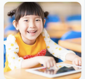
IPADS, APPLE CARE & CASES CAD$850.00