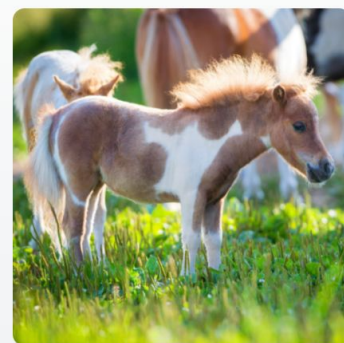
PONY & ANIMAL PETTING ZOO CAD$150.00