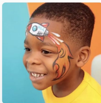
FACE PAINTING - YEAR-END CAD$100.00