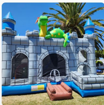
DRAGON BOUNCY CASTLE & SLIDE - YEAR-END CAD$100.00