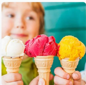
ICE CREAM - YEAR-END CAD$100.00

We're thrilled to announce our Year-End Summer BBQ & fundraiser! To make this event unforgettable, we're looking for sponsors to support a range of exciting activities & items, including a lively Petting Zoo with sheep, bunnies, a donkey, pony & chicks; 2 incredible bouncy castles & games; delicious food, fun prizes & much more! Your sponsorship will help create a memorable celebration for all.