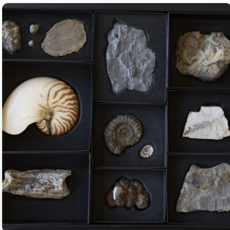
ANCIENT FOSSILS - UBC BEATY BOX CAD$125.00