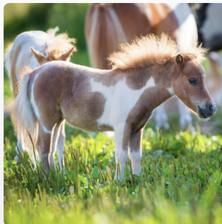
PONY & ANIMAL PETTING ZOO CAD$150.00