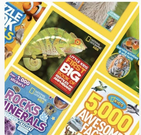
NATIONAL GEOGRAPHIC BOOKS CAD$20.00 - CAD$750.00

EARTHBITES GARDEN PREP: Looking for 16 volunteers to help prep for our EarthBites Garden Workshops on Fri, April 4 & 11 . Tasks Include: Digging up the raised garden beds, removing weeds & adding fresh soil. By doing it ourselves, we're saving $2700 ( quote from a professional landscaper ). Let us know if you're interested in helping! info.paccpp@gmail.com