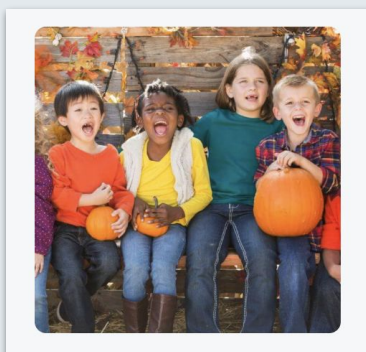
FALL FESTIVAL CAD$75.00

THIS IS YOUR CHANCE TO VOTE on what the PAC spends money on. Without these sponsorships, our students won't have the activities or resources that you see on this page.