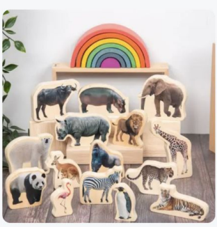
INQUIRY - MY WILD ANIMAL BLOCKS

DON'T KNOW HOW TO DONATE? CLICK HERE or go to