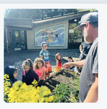
EARTH BITES - GARDEN WORKSHOPS