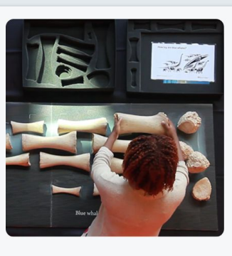
UBC BEATY BOX - BIODIVERSITY KITS